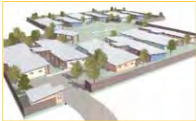
Initial rendering of our ideal Children's Village to be built by Architecture for Humanity

In March 2008, we opened Sooch Village, and established the model for our ideal Children's Village . We are now working to replicate this model at two other locations: Rourkela and Bhawani. We are also partnering with Architecture for Humanity , a San Francisco-based nonprofit design firm whose network of professional architects are donating their